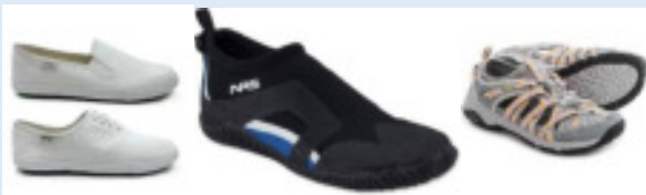
水上活動鞋 Water sports shoes