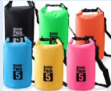
防水袋 Dry Bag