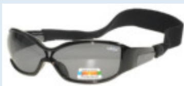
太陽鏡 Sun Glasses