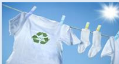
更換衣物 Dry Clothes