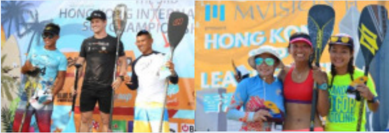
水上運動裝束 Water Sports Wearing